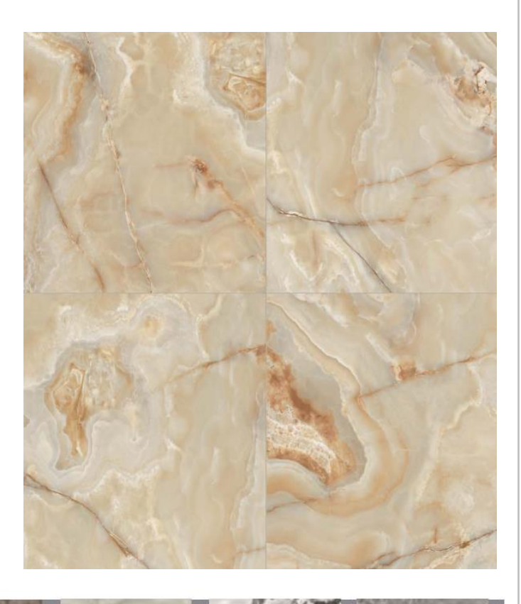
Onyx & More

Or if they prefer a glossy finish they can choose onyx effect porcelain stoneware tiles by Florim , Onyx & More series, 60x60 cm, in the colours below.